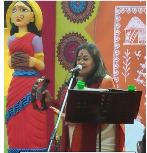
Usha Uthup at what she does best!