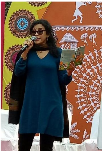
Nandana Sen presenting her new book and interacting with the children.

“Big Little Book” Award Winner author, Nabaneeta Dev Sen soon graced the stage for a dramatized reading of one of her fairy tales which was followed by an interaction with the students. Talking about her love for children and literature for them, Mrs. Sen said that she always tries to make her fairy tales positive and often has young girls as protagonists in her stories.